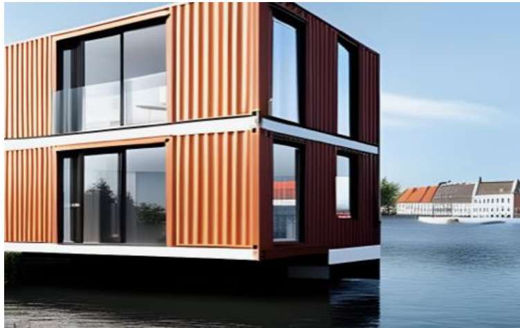
Royal News. 10th anniversary of the Royal Abdication: Bacon Boutiques offer 10% discount to commemorate the date.

Government-Paid Social Programme to bridge polarized communities.