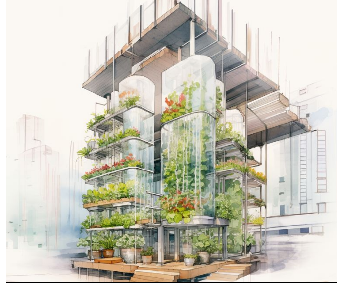
vertical farming and labmeat